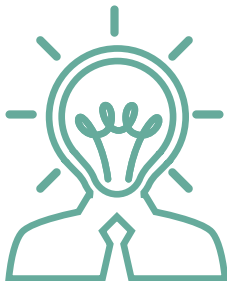
Knowledgeable & Professional

Our structure is such that we can manage each of our properties on a personal basis, tailored to your individual needs.