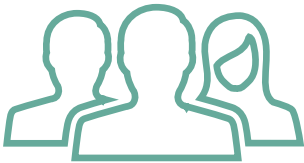
Team of HML Professionals

First and foremost, we are a property management company, renowned for providing excellent customer service.