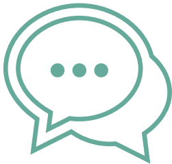
Communication is Key